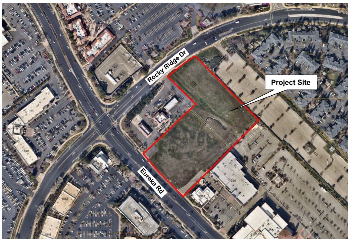
Figure 1: Project Site

The 5.67-acre project site consists of two contiguous parcels located on Parcel 8 of the Northeast Roseville Specific Plan (NERSP). The project site is an L-shaped property which has frontage on both Eureka Road and Rocky Ridge Drive and is addressed as both 1513 Eureka Road (APN 048-013-013-000) and 1411 Rocky Ridge Drive (APN 048-013-014-000) (see Figure 1).