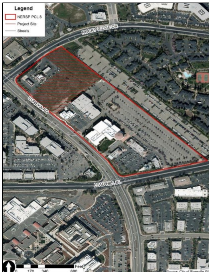
Figure 2: NERSP Parcel 8 and the Project Site

In April 2017, the City's Design Committee approved a Design Review Permit (file #PL16-0169) to allow the project site to be developed with an approximately 75,000-square-foot, 3-story medical office building. A Negative Declaration was adopted with this project. However, the project was never constructed and the entitlements have since expired.